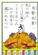
Gentleman from Imperial Family* (Emperor or Prince)

Keep the card. Take all cards held by the player to your right.