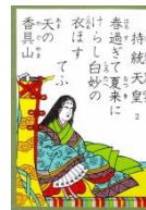
Lady from Imperial Family* (Empress or Princess)

Keep the card. Take all cards in the "pot" between the five decks. If there are no cards in the pot, draw once more and follow the rule of that card. If the card is again a Lady, draw another card.