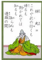
Semi-maru, a hooded hermit

Put the card you drew along with all the cards in your possession into the pot.